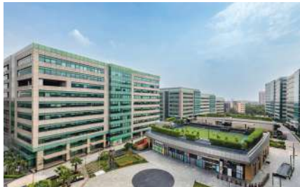
CANDOR TECHSPACE G2, GURUGRAM