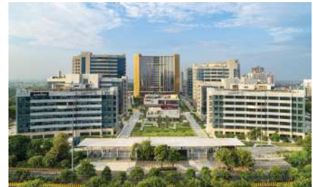
CANDOR TECHSPACE N2, NOIDA