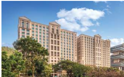
KENSINGTON POWAI, MUMBAI