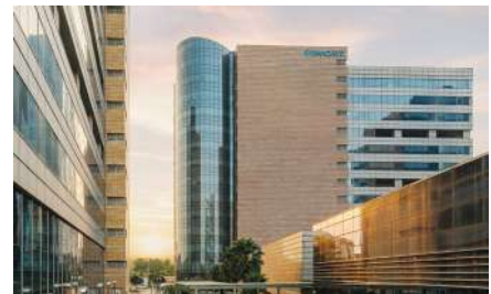
CANDOR TECHSPACE N1, NOIDA