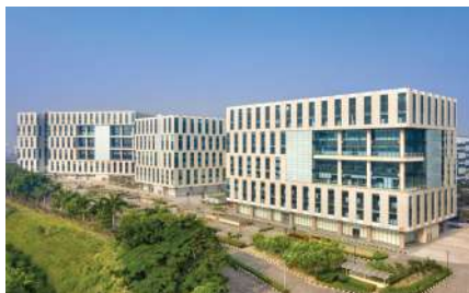
CANDOR TECHSPACE K1, KOLKATA