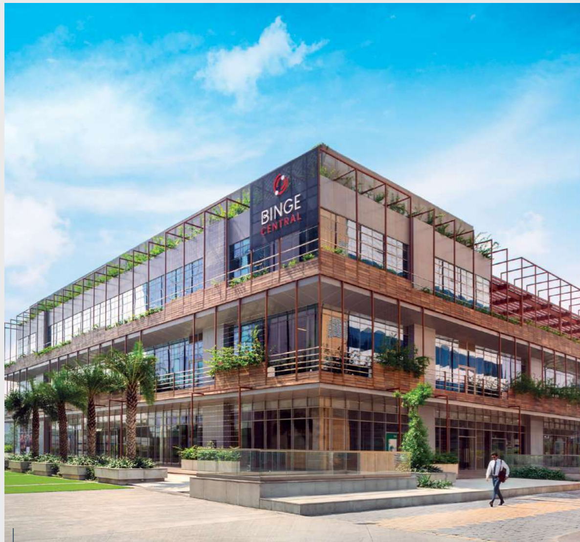
Binge Central at Candor TechSpace N1, Noida

B inge Central – ‘Where life comes alive’ at Candor TechSpace N1, Noida is a dynamic retail hub, transforming the visitor's retail experience. It is designed like a poriferous cube with a square plan that is naturally ventilated and breathes organically to create a pleasant pedestrian experience. The exterior pergola along the building is designed around the central theme of Placemaking and provides a shaded passage for a comfortable commute to pedestrians, along with nooks and avenues where people can meet, relax and bring their conversations alive. With curated cuisines, leading F&B brands and endless entertainment, it is the sought-after destination for shopping and dining within the campus.