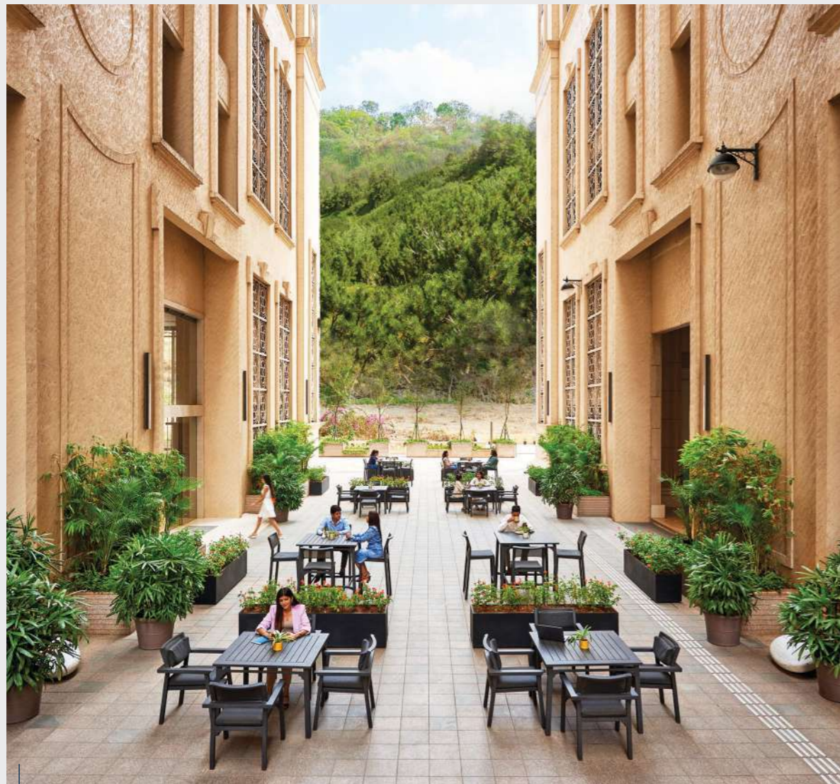
Culture Street at Kensington, Downtown Powai, Mumbai

K ensington, Downtown Powai, Mumbai, embodies a truly sustainable way of life. With 100% green power in the common areas, rooftop solar panels and shared mobility options, we prioritize environmental responsibility. Our water-efficient campus features organic square-foot farming, harmonizing with nature. These sustainability-driven attributes, combined with an array of facilities and amenities, and the location, make Kensington, Downtown Powai, Mumbai the favored office destination in Mumbai.