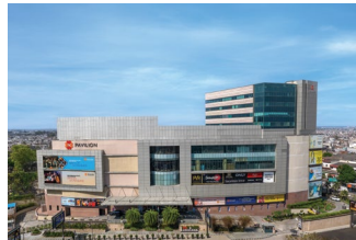
Pavilion Mall, Ludhiana