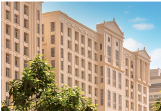
Downtown Powai - SEZ, Mumbai