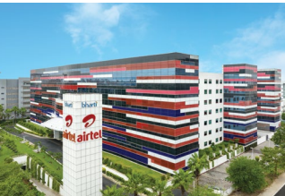
Airtel Center, Gurugram