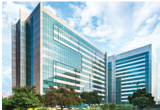
Candor TechSpace G1, Gurugram