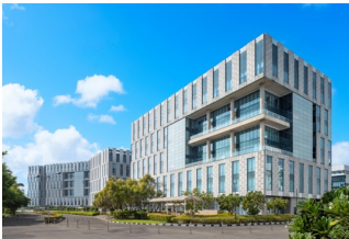
Candor TechSpace K1, Kolkata