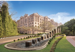
Downtown Powai - Commercial/IT Park, Mumbai

Our tenant base reflects the enduring trust from some of the most prestigious global corporates. Consisting of a mix of global and domestic industry leaders in technology, BFSI, consulting, telecom, healthcare, retail, and others – many of our tenants consider our campuses as a core to their India operations. Our thoughtfully designed, sustainable office spaces are developed to promote productivity, innovation, and employee well-being. The commitment to delivering high-quality infrastructure and service has led to tenant satisfaction, long-term relationships, and growing recognition of Brookfield India REIT as the preferred workspace partner.