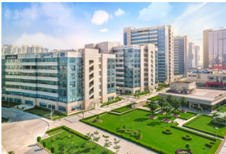
Candor TechSpace N2, Noida