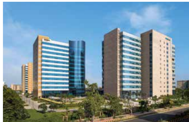
Candor TechSpace N1, Noida