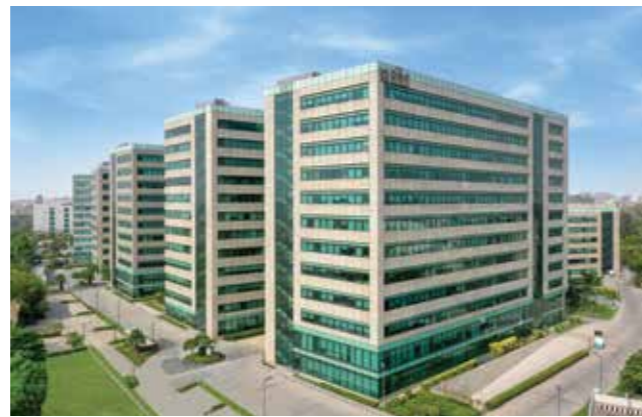
Candor TechSpace G2, Gurugram