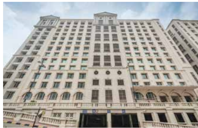
Kensington, Powai, Mumbai