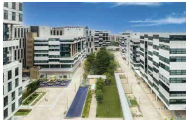
Candor TechSpace K1, Kolkata